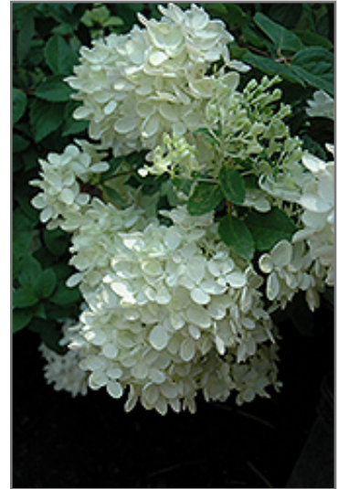
Bombshell Hydrangea flowers

* This is a 'special order' plant - contact store for details