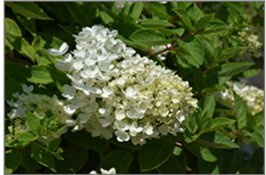
Bombshell Hydrangea flowers