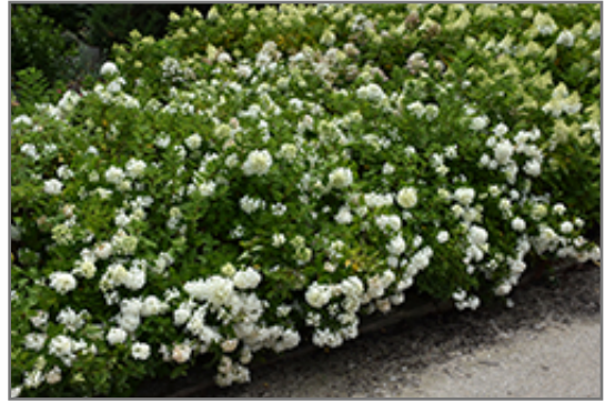
Bombshell Hydrangea in bloom