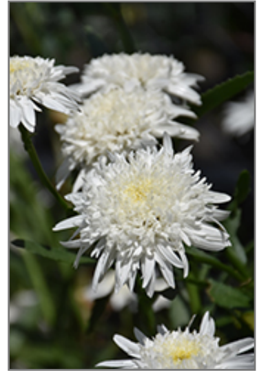
Ice Star Shasta Daisy flowers