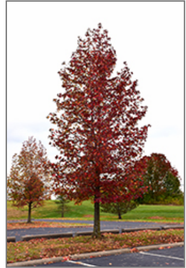
Happidaze Sweet Gum in fall