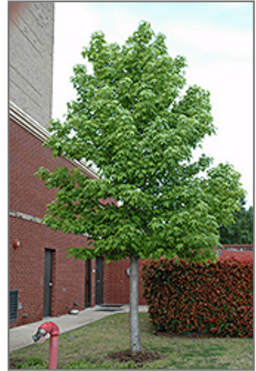
Happidaze Sweet Gum

* This is a 'special order' plant - contact store for details