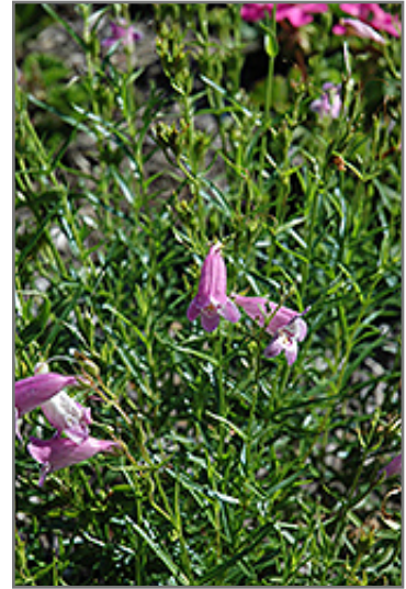
Sweet Joanne Beard Tongue flowers