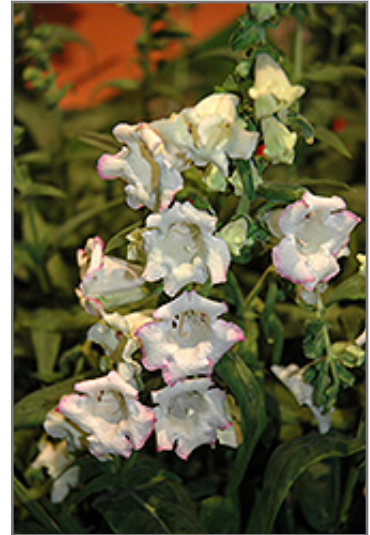
Arabesque Appleblossom Beard Tongue flowers