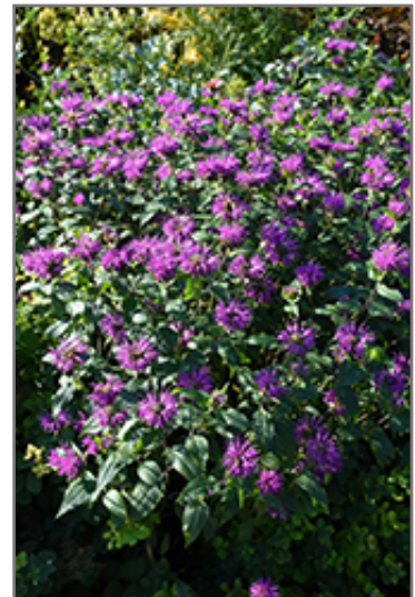
Dark Ponticum Beebalm in bloom