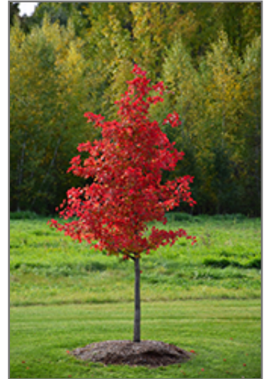
Wildfire Black Gum in fall