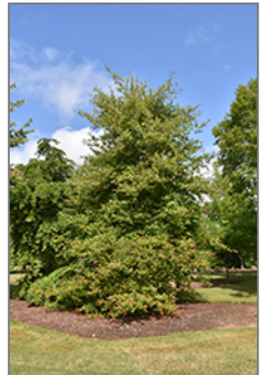
Wildfire Black Gum