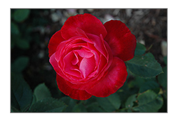
Milestone Rose flowers