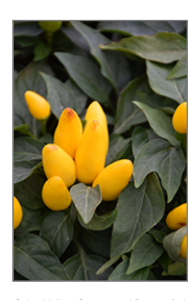
Salsa Yellow Ornamental Pepper fruit

Salsa Yellow Ornamental Pepper is an herbaceous annual with an upright spreading habit of growth. Its medium texture blends into the garden, but can always be balanced by a couple of finer or coarser plants for an effective composition.