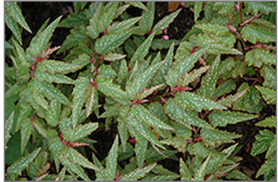
Medora Begonia foliage