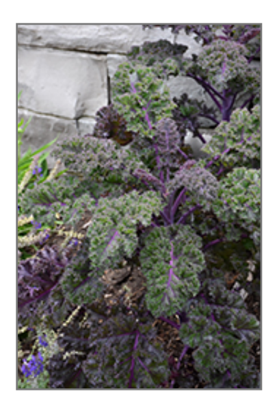
Redbor Kale foliage