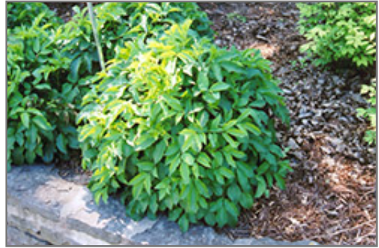
Dwarf European Elder