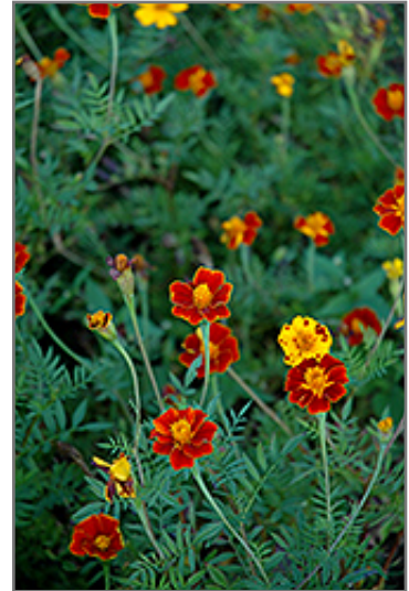
Burning Embers Marigold flowers

Burning Embers Marigold will grow to be about 12 inches tall at maturity, with a spread of 12 inches. When grown in masses or used as a bedding plant, individual plants should be spaced approximately 10 inches apart. Its foliage tends to remain dense right to the ground, not requiring facer plants in front. This fast-growing annual will normally live for one full growing season, needing replacement the following year.