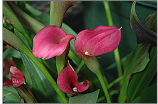
Neon Amour Calla Lily flowers

Other Names: Lily of the Nile, Easter Lily, Arum Lily