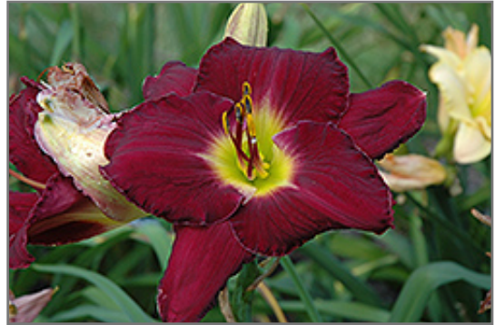
Beaujolais Daylily flowers