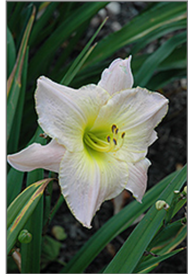
Celestial City Daylily flowers