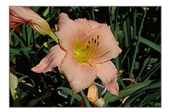
First Waltz Daylily flowers

361 N. Hunter Highway Drums, PA 18222 (570) 788-4181 www.beechwood-gardens.com