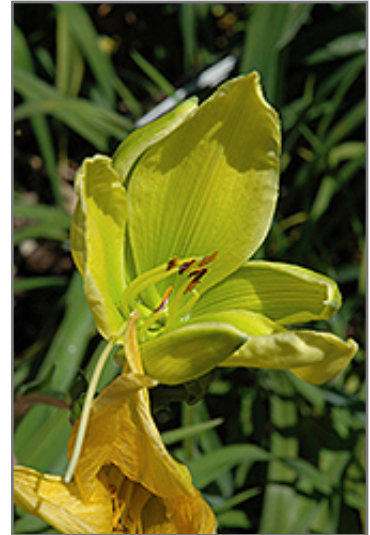
Green Pinwheel Daylily flowers

Green Pinwheel Daylily will grow to be about 30 inches tall at maturity, with a spread of 28 inches. When grown in masses or used as a bedding plant, individual plants should be spaced approximately 22 inches apart. It grows at a medium rate, and under ideal conditions can be expected to live for approximately 10 years. As an evergreen perennial, this plant will typically keep its form and foliage year-round.