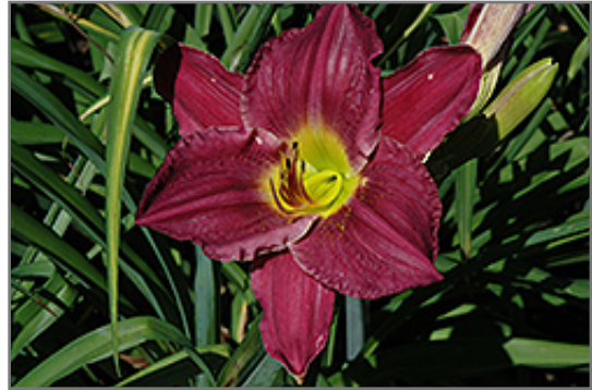
Houdini Daylily flowers

Houdini Daylily will grow to be about 20 inches tall at maturity, with a spread of 18 inches. When grown in masses or used as a bedding plant, individual plants should be spaced approximately 14 inches apart. It grows at a medium rate, and under ideal conditions can be expected to live for approximately 10 years. As an herbaceous perennial, this plant will usually die back to the crown each winter, and will regrow from the base each spring. Be careful not to disturb the crown in late winter when it may not be readily seen!