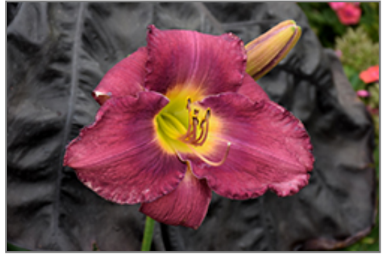
Maestro Puccini Daylily flowers