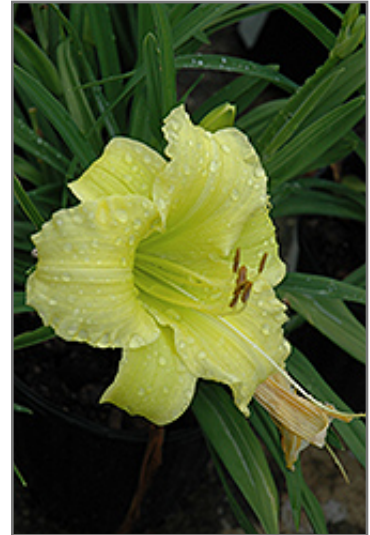
Miss June Daylily flowers