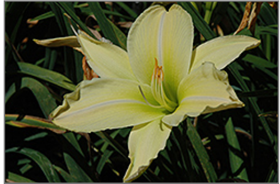
My Peggy Daylily flowers

My Peggy Daylily will grow to be about 24 inches tall at maturity, with a spread of 24 inches. When grown in masses or used as a bedding plant, individual plants should be spaced approximately 18 inches apart. It grows at a medium rate, and under ideal conditions can be expected to live for approximately 10 years. As an evergreen perennial, this plant will typically keep its form and foliage year-round.