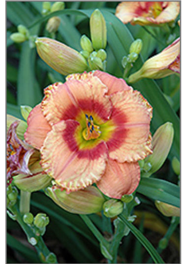
Penny Serenade Daylily flowers