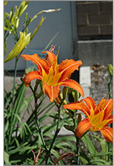
Orange Daylily flowers

Outstanding, large, orange flowers with red eyezones and yellow centers; narrow petals; can grow up to 6 feet tall; sturdy, strong, easy to care for, great grassy texture and form; good for the beginner gardener and the pro