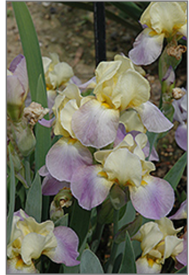
Enriched Iris flowers