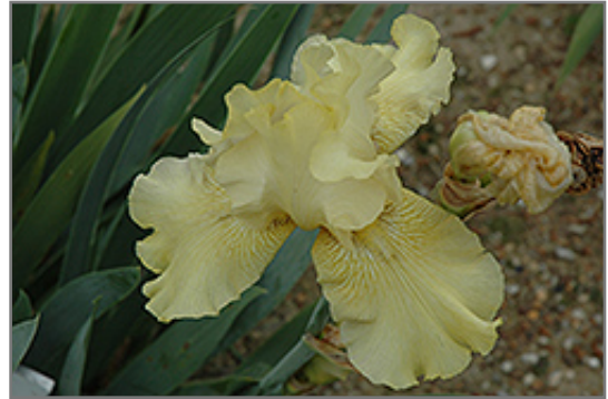
Lichen Iris flowers