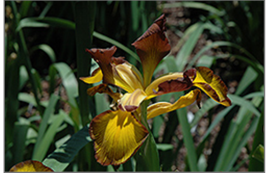
Lucky Devil Iris flowers