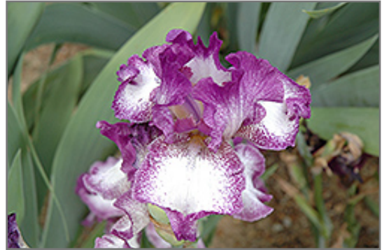
Mariposa Autumn Iris flowers

This impressive iris produces dazzling violet blooms with white falls edged in violet, and white tipped beards; a stunning addition to the perennial border; also excellent massed in groupings in the garden; will quickly form dense colonies