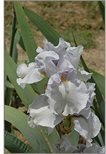
Misty Twilight Iris flowers

This elegant iris produces luminous, creamy pale blue-violet blooms with blue tipped beards; a stunning addition to the perennial border; also excellent massed in groupings in the garden; will quickly form dense colonies