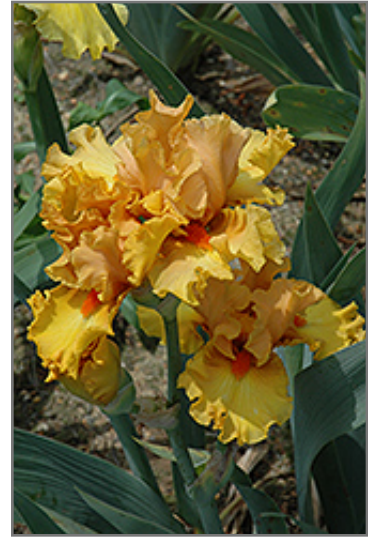
Nectar Of The Gods Iris flowers

This impressive iris produces luminous peach and gold blooms with dark orange-red beards; a stunning addition to the perennial border; also excellent massed in groupings in the garden; will quickly form dense colonies