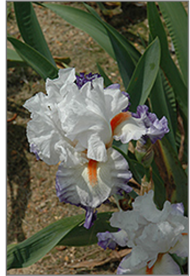
Restless Heart Iris flowers