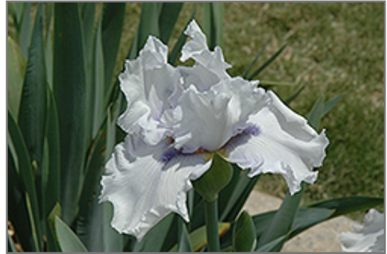
Titanic's Nemesis Iris flowers

This luminous iris produces spectacular, ice blue blooms with bright blue tipped beards; a stunning addition to the perennial border; also excellent massed in groupings in the garden; will quickly form dense colonies