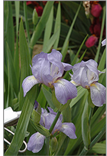
Tracking Iris flowers