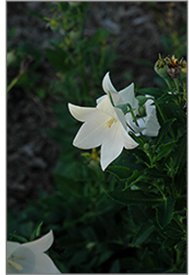
Mini Balloon White Balloon Flower flowers