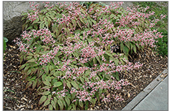
Pink Champagne Fairy Wings in bloom