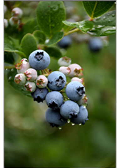
Duke Blueberry fruit

Duke Blueberry features dainty clusters of white bell-shaped flowers with shell pink overtones hanging below the branches in mid spring. It has green deciduous foliage. The glossy oval leaves turn an outstanding orange in the fall. It features an abundance of magnificent blue berries from late spring to early summer. The smooth yellow bark adds an interesting dimension to the landscape.