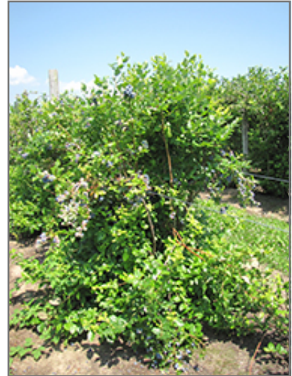
Duke Blueberry fruit

* This is a 'special order' plant - contact store for details