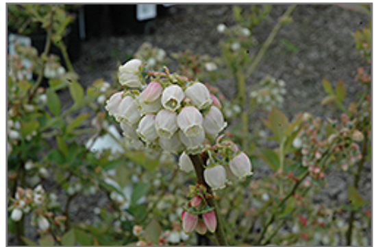
Duke Blueberry flowers