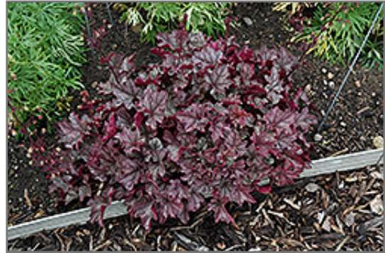
Crown Jewel Coral Bells

Crown Jewel Coral Bells is recommended for the following landscape applications;