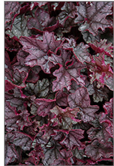
Crown Jewel Coral Bells foliage