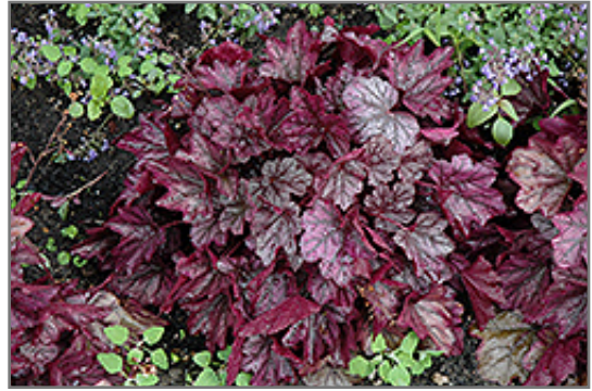
Dolce Blackberry Ice Coral Bells foliage