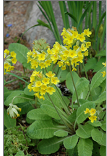
Oxlip in bloom

This lovely selection produces upright stems with clusters of fragrant, butter yellow trumpet flowers with gold centers, above a rosette of bright green leaves in mid-spring; excellent in containers and window boxes