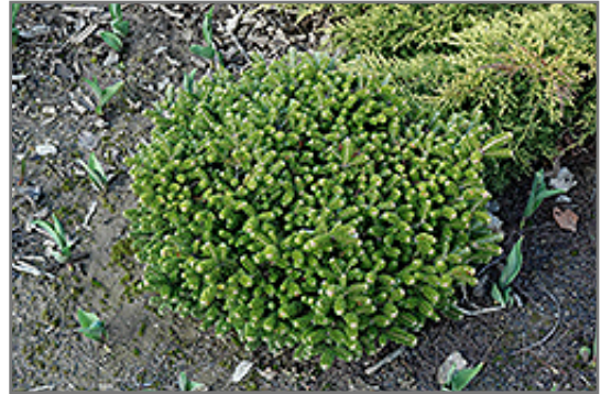
Oberon Korean Fir

A beautiful, slow growing dwarf variety that has a neat, mounded habit; showy white buds crown the branches in late fall and winter; ideal for a rock garden, particular as to siting