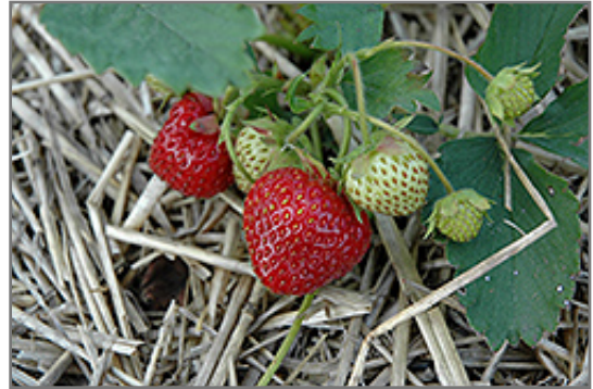
Everest Strawberry fruit