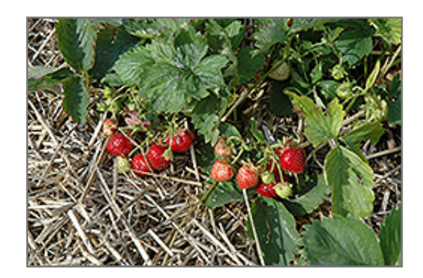
Governor Simcoe Strawberry fruit

361 N. Hunter Highway Drums, PA 18222 (570) 788-4181 www.beechwood-gardens.com