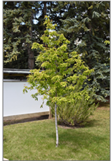
Amur Maple (tree form)