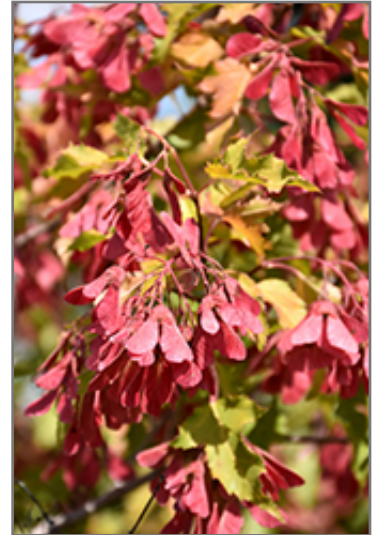
Amur Maple (tree form) fruit

* This is a 'special order' plant - contact store for details