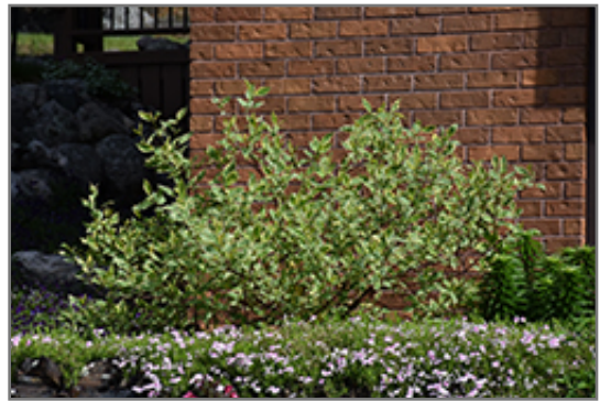
Cream Cracker Dogwood