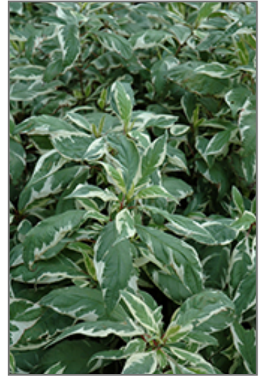
Cream Cracker Dogwood foliage

Cream Cracker Dogwood is recommended for the following landscape applications;