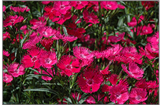
Bouquet Rose Pinks flowers

Bouquet Rose Pinks is recommended for the following landscape applications;