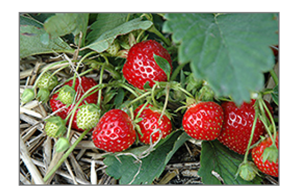
Itasca Strawberry fruit

361 N. Hunter Highway Drums, PA 18222 (570) 788-4181 www.beechwood-gardens.com