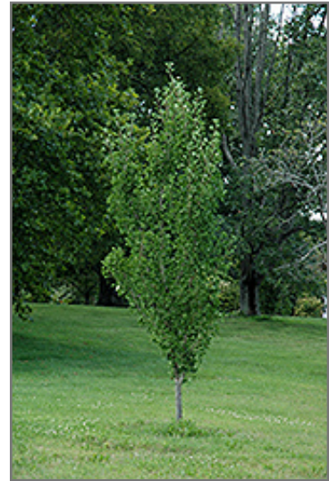
Presidential Gold Ginkgo