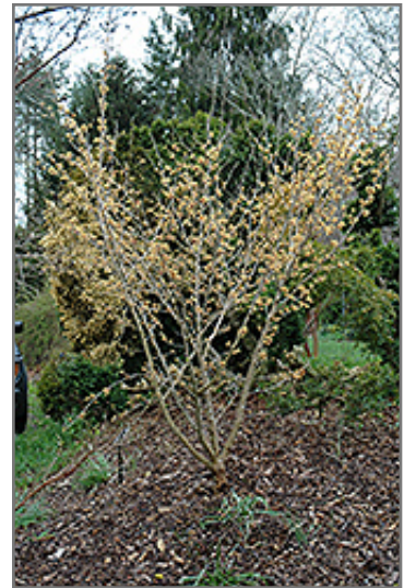
Orange Encore Witchhazel in bloom