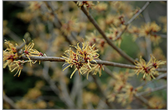
Orange Encore Witchhazel flowers