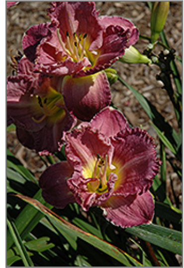
Magic Amethyst Daylily flowers