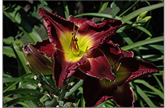
Midnight Raider Daylily flowers